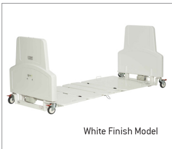
White Finish Model