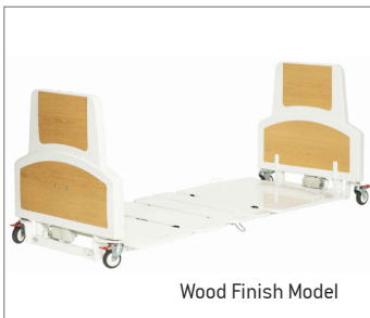
Wood Finish Model